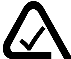
A-Tick Mark (Telecom Australia)