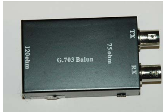
Figure 1-3 75 Ohm E1 Balun

Each 75 Ohm trunk is normally connected via a pair of coaxial cables with BNC connectors. A Balun is available to convert between RJ45 and co-axial cabling. The Balun also converts between 120 and 75 Ohm interfaces, so the system does not need to be configured for 75 Ohm operation when this type of converter is used.